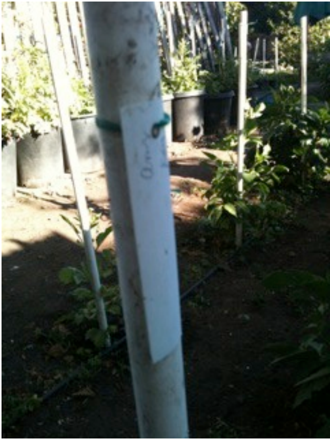
To stake her dahlias, Millie uses PVC pipe with an attached label using recycled pieces of window blinds. The labels conform to the shape of the pipe.