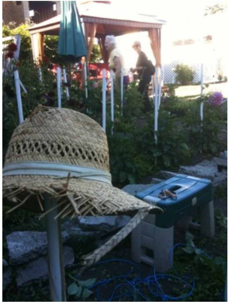
The gazebo offers a relaxing site for shade and viewing the dahlias.