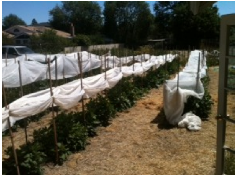
Providing much needed shade on a hot day.

Fortunately, the heat subsided after four days. I still have the Agribon cloth up high on my stakes but with the weather cooling off this week I will soon remove it. What we do for our dahlias!