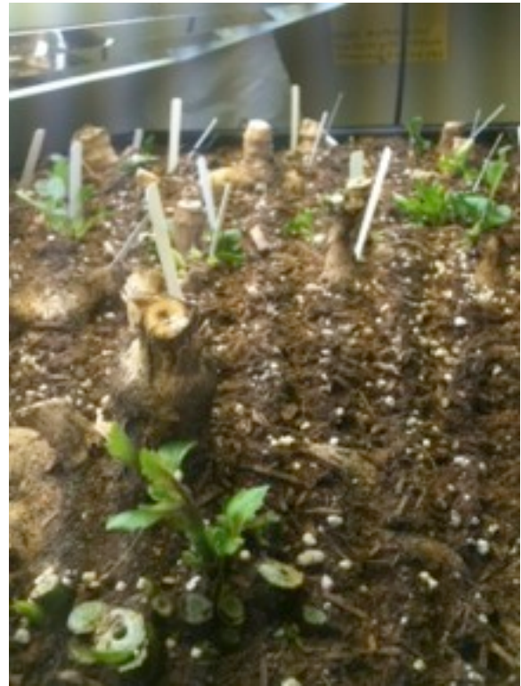
Sprouting tubers in the cutting bed.

I love starting dahlias in the winter and one way I jump start my growing season is a cutting bed. My bed is two by four feet with a heating cable, overhead grow lights, sand and potting soil. Sixty tubers or pot roots fit this space. The tubers or pot roots are planted shallow with the crowns showing so the first sign of a sprout can be detected and easily cut. I started in early February and now have over 80 tiny plants. I purchased some of my pot roots from Les and Viv Connel's Dahlias. I also made my own pot roots by growing cuttings or tubers in four inch pots last season which encouraged a small tuber mass.