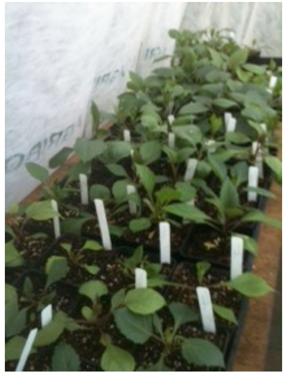
Seedlings potted up into 4" pots.

Even though the tubers are tiny, each one still produces many sprouts that are cut off, dipped in a rooting solution, and planted in dixie cups filled with wet play sand. The cuttings must be kept warm, have overhead lights, and misted with water every day. Within a month or so roots develop and the growing begins. I then transplant them into four inch pots and put them in my outdoor hoop house. When Spring arrives, I plant them in my dahlia patch under an Agribon hoop tunnel to keep them warm and toasty until the weather heats up.