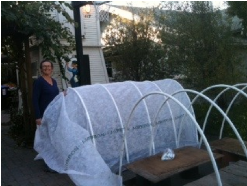
Hoop house constructed with PVC pipe and covered with Agribon.