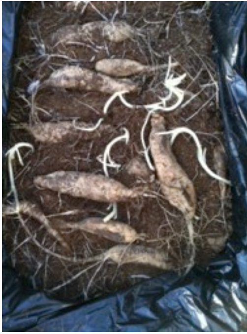
Opening up the stored tubers.