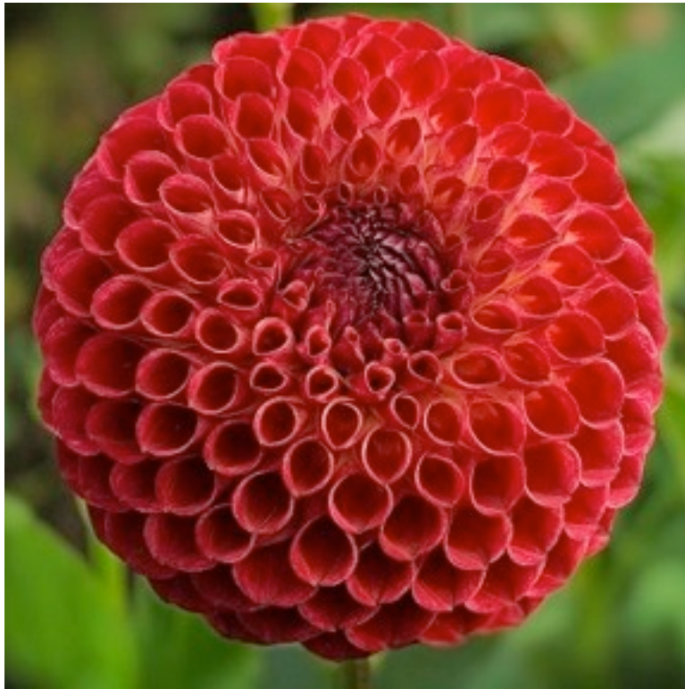
Camano Mordor 6013 Ball Dark Blend DP/P