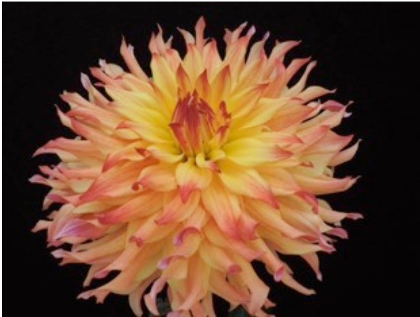
Bloomquist Sun Rays 3110 BB ID LB

This month we will raffle off Bloomquist John F., Bloomquist Sun Rays and Camano Morder. Please remember these are the tubers that will be distributed next year after they've been grown out for one year.