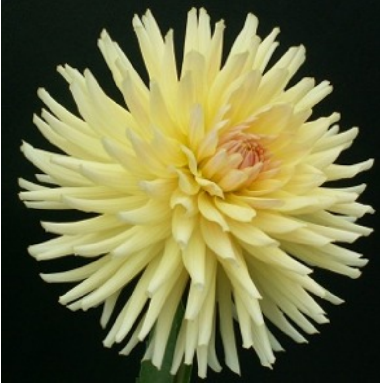
Clearview Citron 3402 BB IC Yellow

This month we will raffle off 2 cultivars Clearview Citron and Clearview Sharon . Note how similar they are yet one is a cactus and the other an incurved cactus. Please remember these are the tubers that will be distributed next year after they've been grown out for one year.