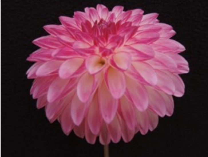
Tahoma Big M

This is our last month of the Tuber Purchase Program Raffle. The last 3 cultivars to be raffled off are Tahoma Big M , miniature formal decorative dark pink and white, Willie Willie an orchid, and Woodland's Naomi a miniature lavender formal decorative.