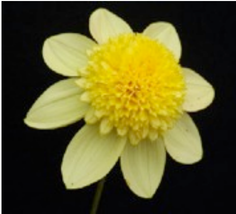
Sandia Sunbonnet 8202 Collarette