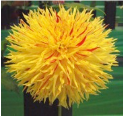
Sandia Suncatcher 2514